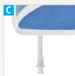
Luer Lock connection