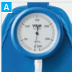
A Precision Manometer Robust & durable