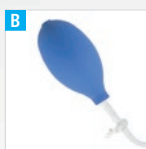
Hand Inflator and stop cock only