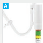
Hand inflator with colour coded pressure indicator